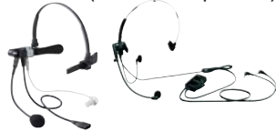
HS-102 Earphone type. OPC-2359 is required. HS-85 Over-the-head type. OPC-2144 is required.