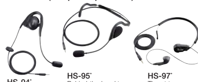
HS-94 Earhook type HS-95 Behind-the-head type HS-97 Throat type

* Either OPC-2006LS or OPC-2328 is required when using any of these headsets.