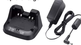
BC-202 BC-123S* *BC-123SA for 120V AC, SE for 230V AC.