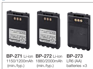
BP-271 Li-ion 1150/1200mAh (min./typ.) BP-272 Li-ion 1880/2000mAh (min./typ.) BP-273 LR6 (AA) batteries x3