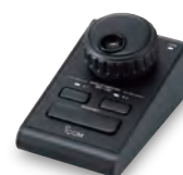
RC-28 Remote Encoder