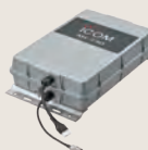
AH-730 Covers 1.8 ~ 54 MHz with a 7 m, 23 ft or longer wire antenna.