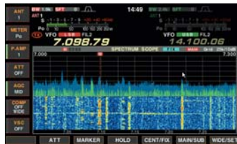
Spectrum scope with waterfall (wide screen setting)