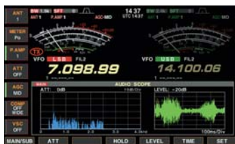
Audio scope (FFT scope and oscilloscope)

* Transmitting audio can be shown on voice modulation modes only. The transmit quality monitor function must be ON for monitoring the transmitting audio.