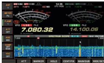
Spectrum scope with waterfall

The spectrum waterfall function can show the changing amplitude of frequency spectrum over time. A weak signal which cannot be recognized with the spectrum scope may be found in the waterfall screen. When used in combination with spectrum and waterfall screens, you can observe detailed band activity by other stations. The wide screen setting emphasizes the signal strength in the spectrum scope and shows a longer period for the waterfall.