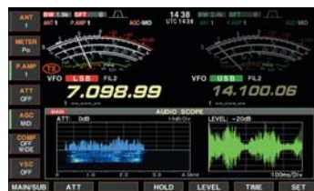
Audio scope (FFT scope with waterfall and oscilloscope)