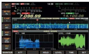
Mini spectrum scope and audio scope