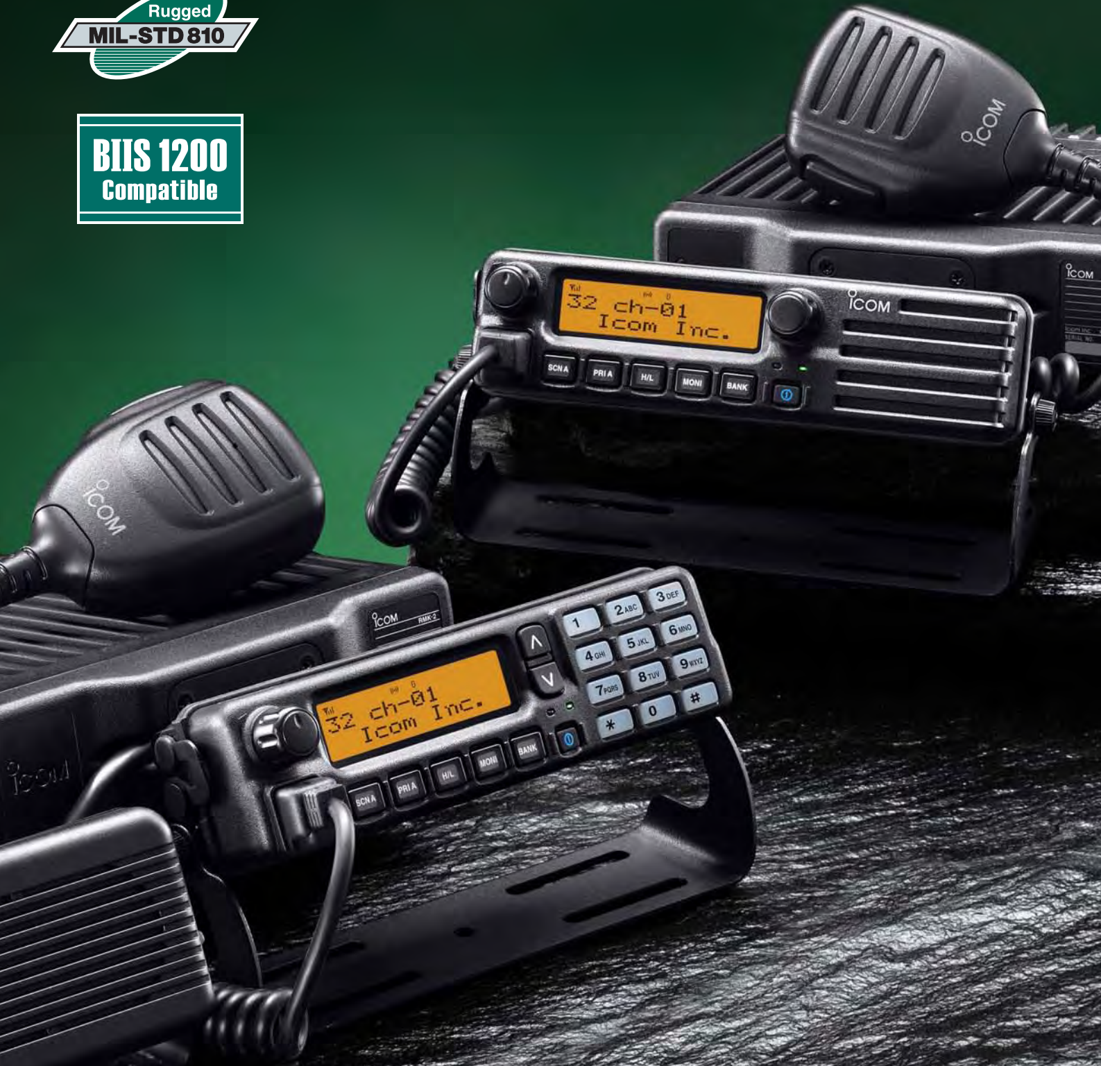
Photo includes optional separation kit, RMK-2 and separation cable, OPC-609.