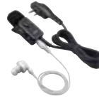
HM-153LA Lapel type microphone with earphone