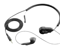
HS-97 + VS-4LA or OPC-2004LA* Throat microphone with earphone

* Either VS-4LA or OPC-2004LA is required when using HS-97 headset. VS-4LA: PTT switch cable for manual PTT operation OPC-2004LA: Plug adapter cable for VOX hands-free operation HS-94 and HS-95 also can be used with either VS-4LA or OPC-2004LA.