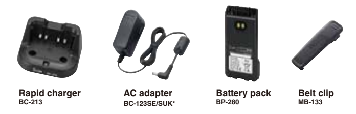
Rapid charger BC-213