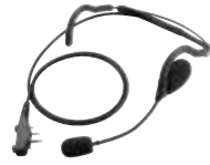
HS-95LWP Behind-the-head type with boom microphone and waterproof connector