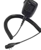
HM-159LA Full size durable speaker-microphone