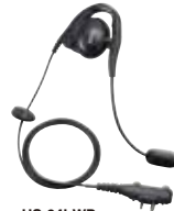
HS-94LWP Earhook headset with boom microphone and waterproof connector