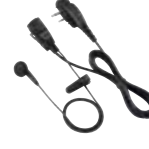
HM-166LA Light weight earphone microphone