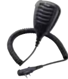
HM-168LWP IP67 waterproof speaker-microphone