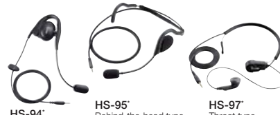
HS-94 Earhook type HS-95 Behind-the-head type HS-97 Throat type

* Either OPC-2006LS or OPC-2328 is required when using any of these headsets.